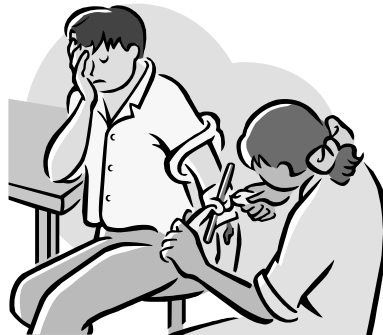
An injury (wound or broken bone)