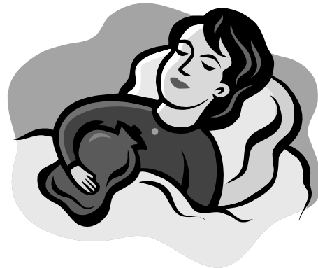
A stomach ache