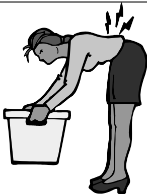
A sore back